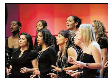
Sense of Sound singers

● Voices Festival , Liverpool, March 16-18, senseofsound.net .