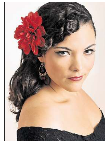
Dutch singing star Caro Emerald

● Caro Emerald, March 19, Bridgewater Hall, Manchester, bridgewater-hall.co.uk or caroemerald.com .